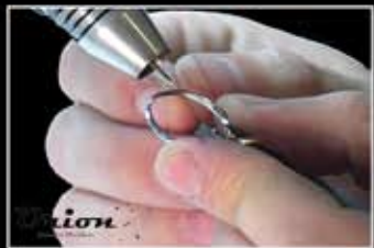
Fill and Fix Porosity in Seconds

Junior apprentices and master jewelers alike will find the Orion to be the perfect addition to any jeweler's bench.