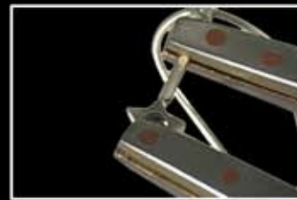
Temporarily Tack or Permanently Fuse