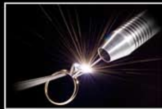
Retip a Prong with the Stone Still Set